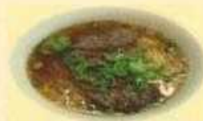
Beef Cantonese Noodle Soup