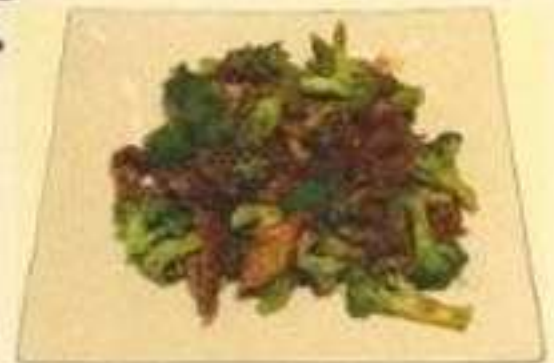
Beef w. Broccoli