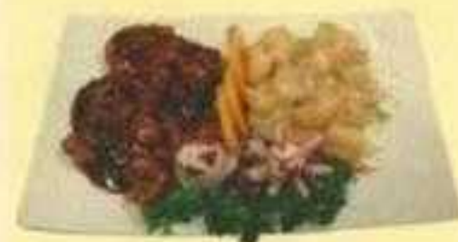
Dragon & Phoenix