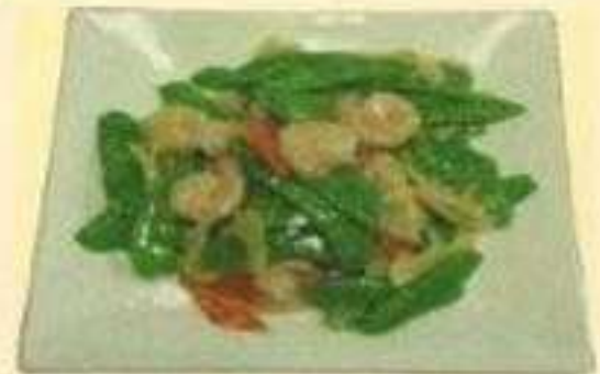
Shrimp W. Snow Peas