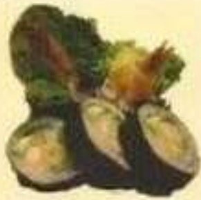
Shrimp Tempura Roll