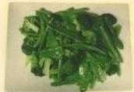
Triple Jade Delight