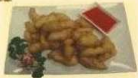
Sweet & Sour Chicken