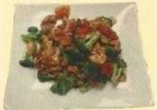
Chicken w. Garlic Sauce