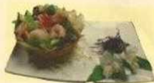
Seafood In Birdnest