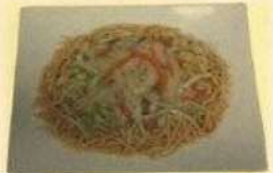
Chicken Chow Mein