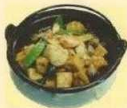
Seafood & Beancurd Casserole