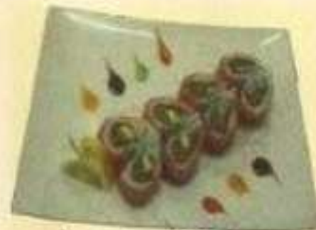
Tuna Lover's Roll